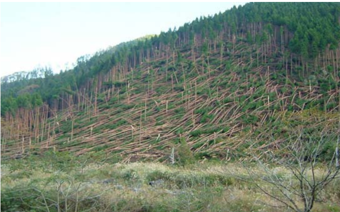
Effects of disasters on natural resources

The November 2004 typhoons in the Philippines claimed over 1,000 lives and devastated the livelihoods of many more. The recent Indian Ocean Tsunami was even more destructive: more than 150,000 lives were lost.