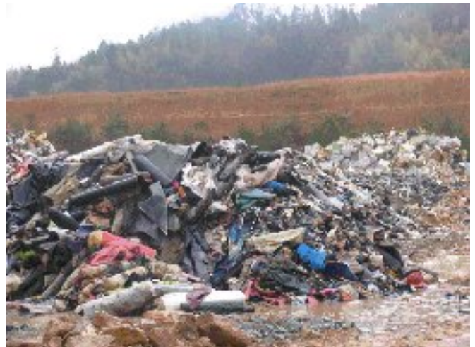
Effective management of debris and rubble is a critical environmental need in the follow-up to a disaster

The impacts of disasters, whether natural or man-made, not only have human dimensions, but environmental ones as well. Environmental conditions may exacerbate the impact of a disaster, and vice versa , disasters have an impact on the environment.