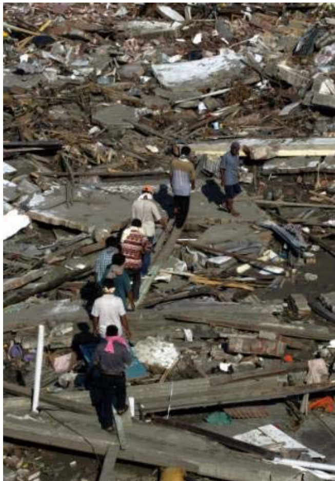
Wide-spread destruction as a result of the Indian Ocean Tsunami in December 2004

sustainably, but also reduces the risks that natural and man-made hazards pose to people living today. Emphasizing and reinforcing the centrality of environmental concerns in disaster management has become a critical priority, requiring the sound management of natural resources as a tool to prevent