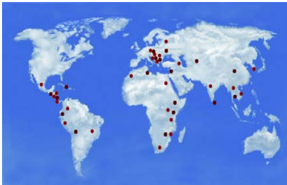
The global network of NCPCs.

UNIDO and UNEP therefore develop and strengthen national capacities for delivering RECP services to businesses, governments and other organizations. This enables them to implement RECP concepts, methods, techniques and policies and thereby reduces their pollution and waste intensities and improves efficiency of their natural resource use. In addition, UNIDO and UNEP operate and contribute to regional and global networks to transfer knowledge and technology efficiently, both South-South and North-South.